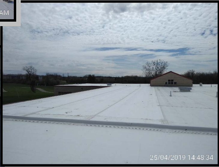
Before and after protective roof film removed