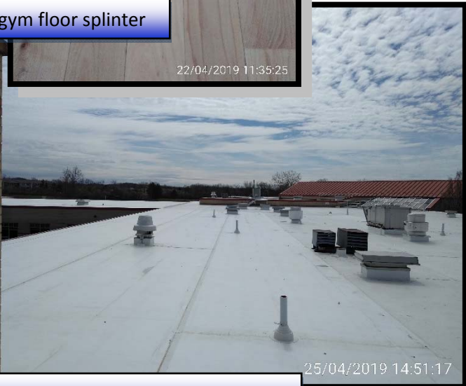
Before and after protective roof film removed